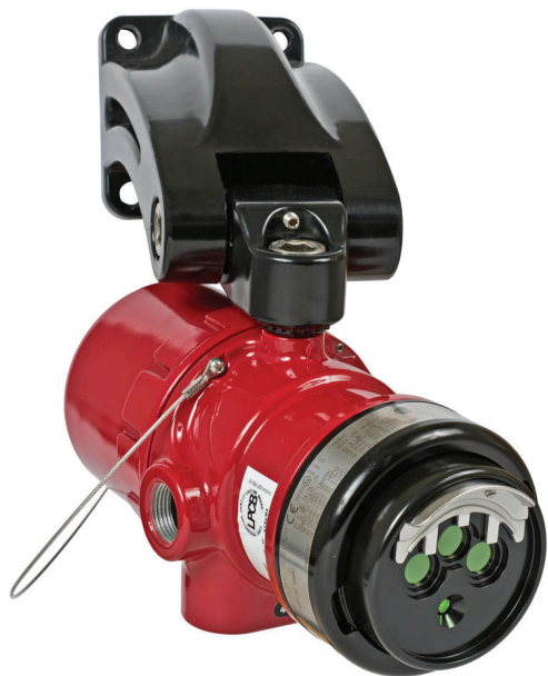
Figure 3: To “see” hydrogen flames, today's best technology is multispectrum infrared flame detection as used in the new Det-Tronics X3302 MIR flame detector shown.

On the downside, the range of MIR flame detectors is reduced by the presence of water or ice on the lens. To mitigate this problem, some detectors are equipped with lens heaters that melt ice and accelerate evaporation of water.