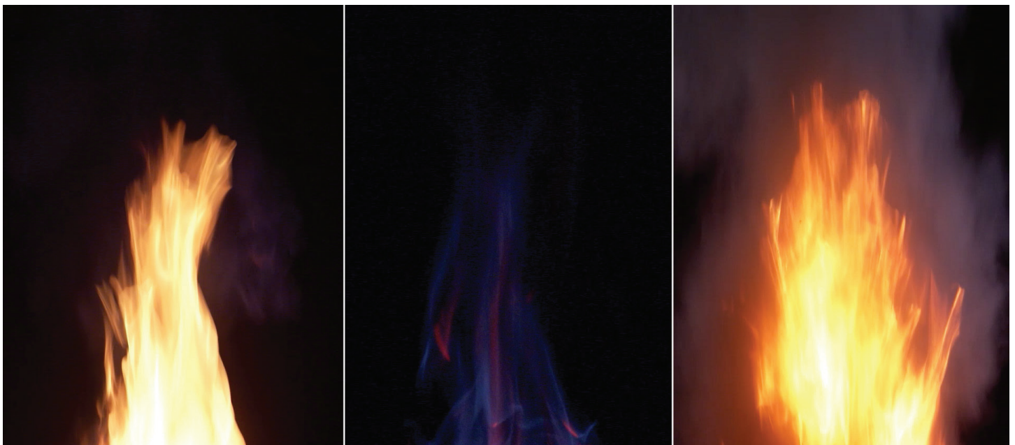
Figure 2: Every combustible gas burns differently, producing a signature flame. Compared to hydrocarbon flames depicted on the right and left above, a hydrogen flame (center) emits little visible light and IR radiant heat and therefore is more difficult for people and equipment to detect.

This makes catalytic bead-type detectors the right choice for detecting hydrogen at lower flammable limit (LFL) levels. A catalytic bead sensor detects any combustible gas that combines with oxygen to produce heat. If the gas can burn in the air, this sensor will detect it.